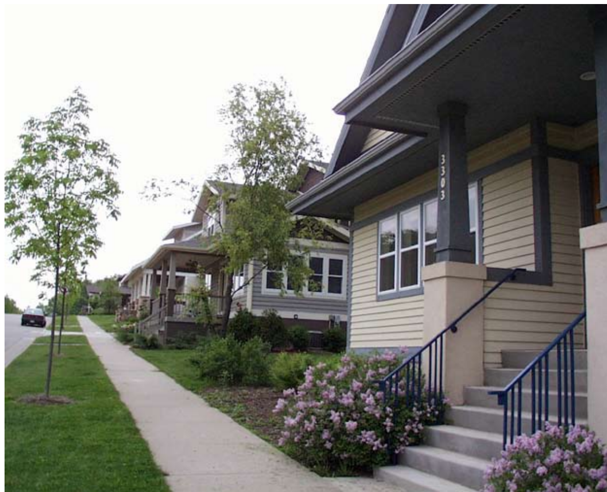
Middleton Hills.

Also Thursday, a walking tour of Madison's Block 89 adjacent to Capitol Square features office towers, retail uses facing the square, award winning restaurants, and a unique air handling system taking advantage of passive solar heating—all held together by unique joint financing.